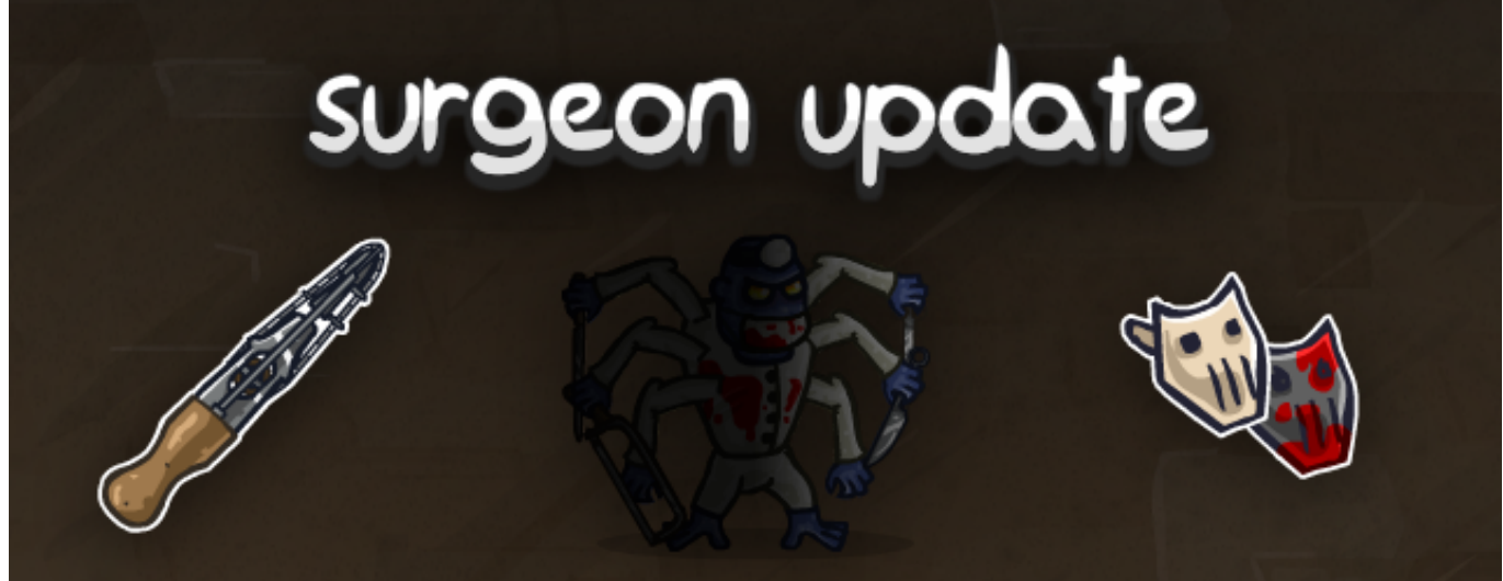
https://www.youtube.com/watch?v=RB6UeL8DU-Y New boss time!