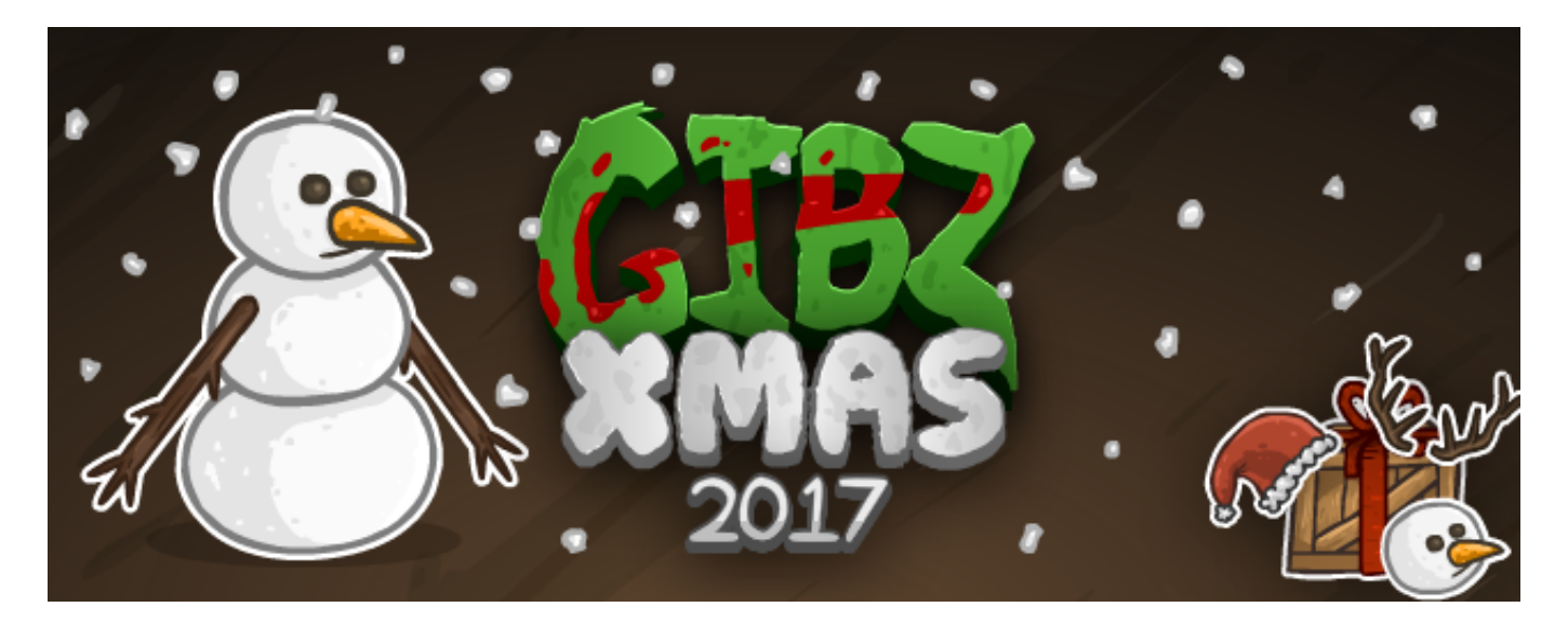
The GIBZ Xmas event is back! Everything from last year + one new achievement/hat and a snowy map for Zombie Surfing.